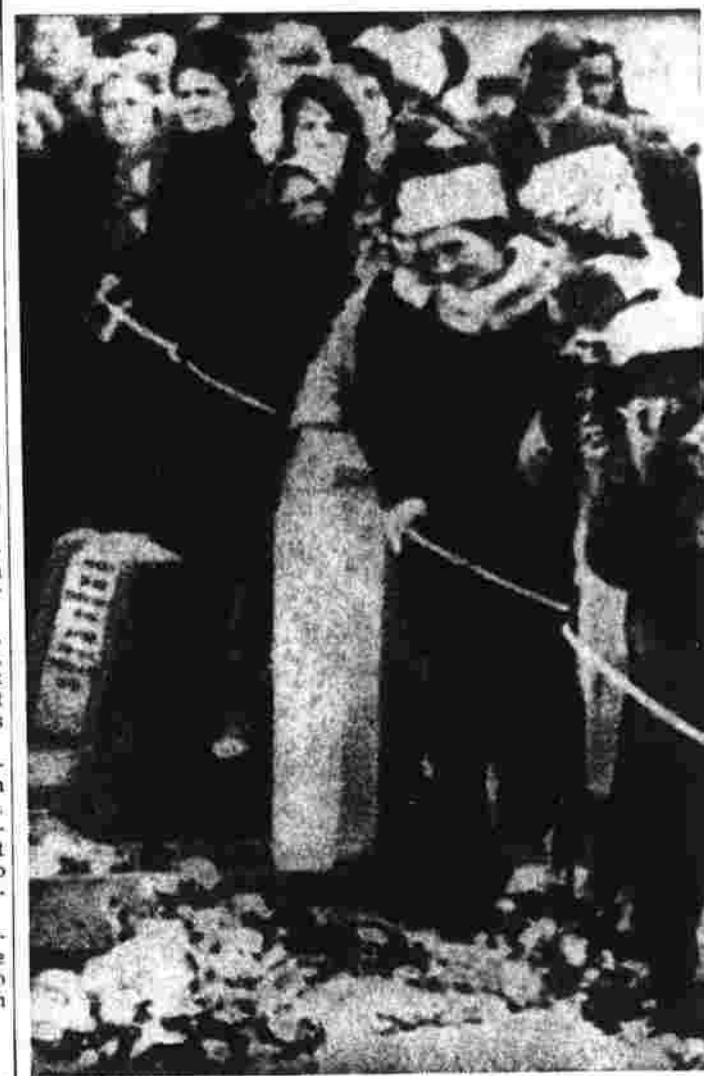
Women, many stifling tears, pause at the grave of Sir Winston Churchill in churchyard at Bladon. More than 125,000 have visited the site since the warrior-statesman was laid to rest.

WASHINGTON (AP)—The Senate amended the $1.09-billion Appalachia aid bill to pave the way for a possible share in its benefits for 13 New York counties. The amendment was a personal victory for Sen. Robert F. Kennedy, D-N.Y., author of the amendment, in his first Senate floor test of strength. He voiced an implied criticism of New York's Republican Gov. Nelson A. Rockefeller for not having sought the action. Approval was by voice vote, with Sen. John Sherman Cooper, R-Ky., the only senator to speak against it. Cooper contended it should have been handled as separate legislation. Kennedy offered the amendment, accepted a modification of it proposed by Sen. Jacob K. Javits, R-N.Y., and won its approval after assurances that other regional plans similar to Appalachia will get consideration this year. Sponsors had feared the biggest threat to the measure came from senators who wanted to add amendments to establish